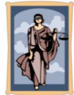
State Bar Association of North Dakota

Various IVN sites in North Dakota Approved for 2.75 CLE Hours (ND) CLE Credit will be applied for in MN