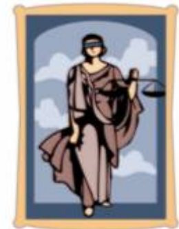
State Bar Association of North Dakota