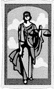
State Bar Association of North Dakota