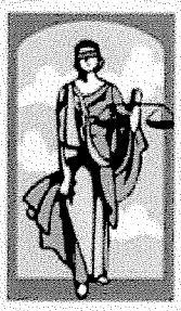
State Bar Association of North Dakota